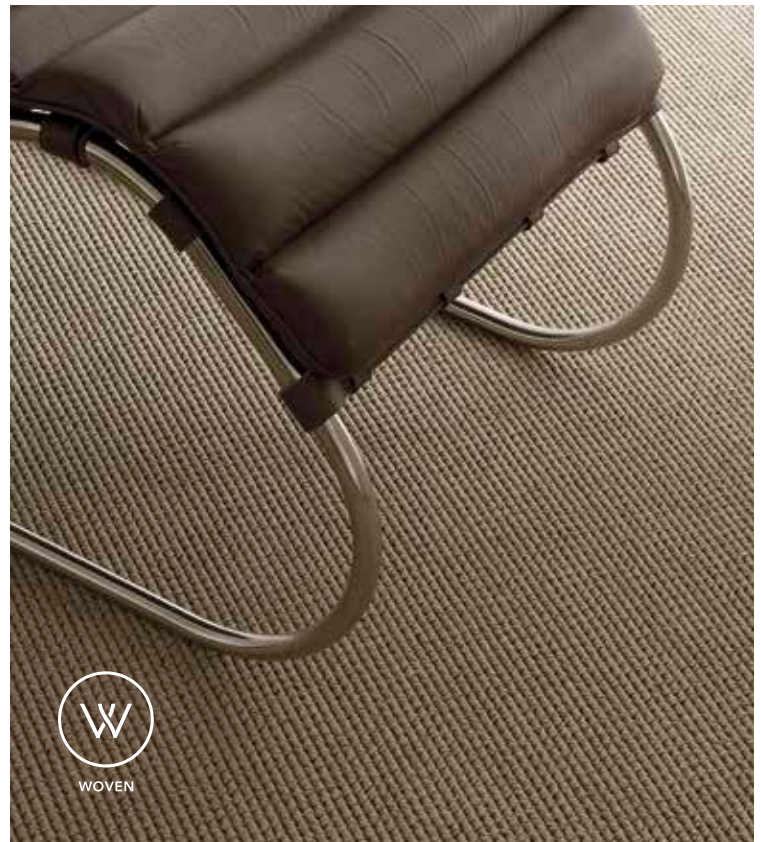
FULL VOLUME III