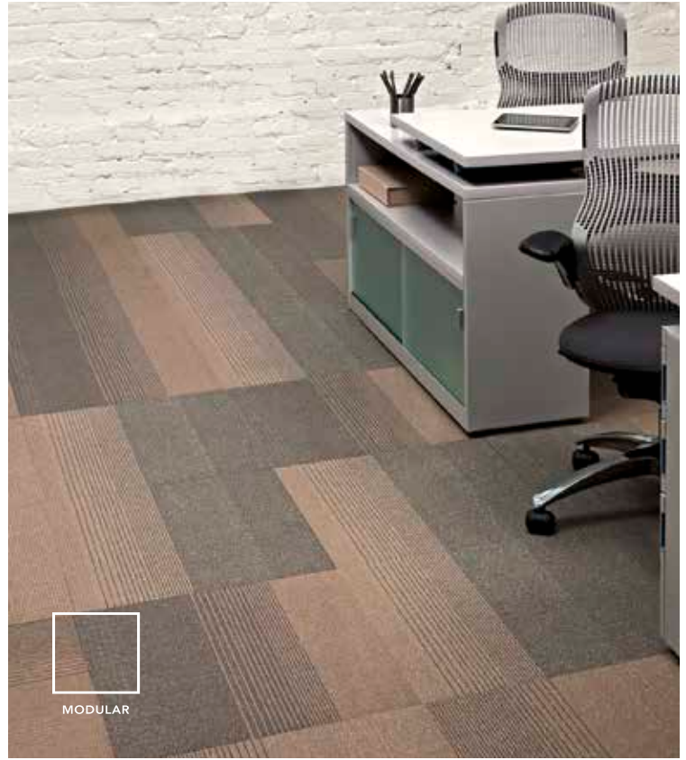
FACTORY FLOOR II